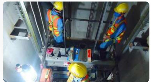
Lift License & Third Party Insurance