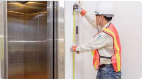
New Lift Installation

A non-operating lift can result in downtime and may cause discomfort. And, it can be very unsafe as well. So, it is wise to get expert services to avoid any serious trouble. It is essential to make sure that your lift is working in the right condition. Also, we know how critical the safe operation of your elevators is to you. Hence, you can contact Innovative Elevator for the best elevator repair service in Delhi/NCR.