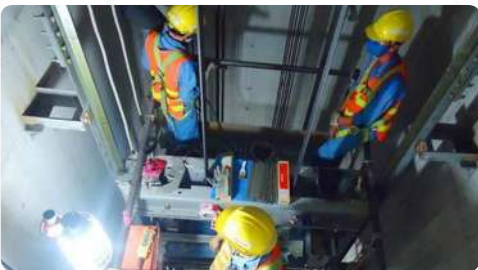
Lift Repair And Part Replacement